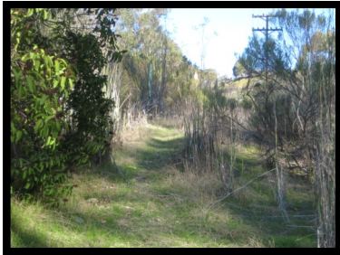
12. Manhole #142 32° 49.30 N 117° 15.11 W

Just left of new path (marked by green pole). Continue on new path.