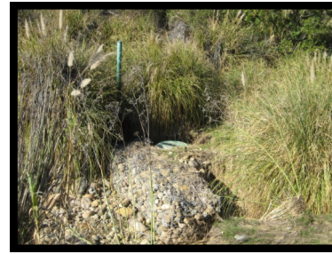
15. Manhole #93 32° 49.42 N 117° 15.09 W

Left of path; marked by green pole. Follow around shrub to get to MH #86.