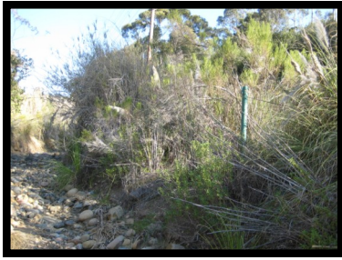
10. Manhole #150 32° 49.26 N 117° 15.12 W