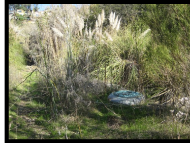
16. Manhole #86 32° 49.45 N 117° 15.10 W

Left of trail; on incline; easily visible. When path veers right, head left up grassy path to MH#142.