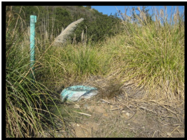
14. Manhole #92 32° 49.39 N 117° 15.09 W

Easily visible on right side of path. Continue on same path.