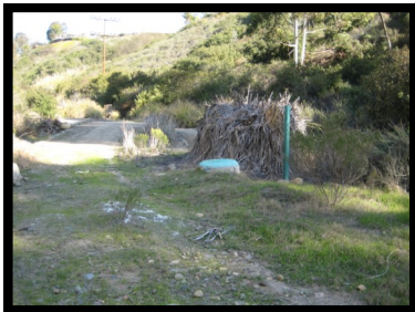
13. Manhole #91 32° 49.35 N 117° 15.10 W

Easily visible on right side of path. Continue on same path.