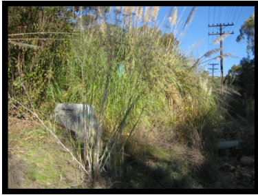
11. Manhole #149 32° 49.28 N 117° 15.12 W

Left of path; marked by green pole. Follow around shrub to get to MH #86.