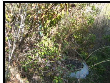
17. Manhole #82 32° 49.49 N 117° 15.10 W

Just left of new path (marked by green pole). Continue on new path.